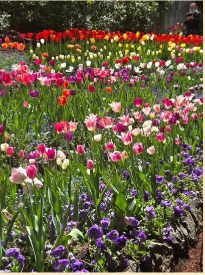
Colorful blasts of tulips in bloom at the Crystal Hermitage Gardens