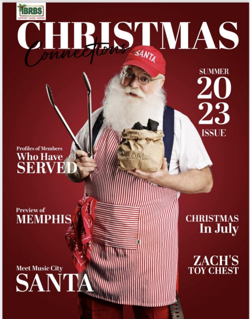
IBRBS Christmas Connections Summer 2023