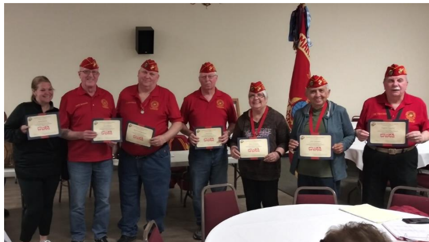
Seven members received a Certificate of Appreciation from The U.S. Marine Corps Reserve for Outstanding Support of the Toys for Tots program.