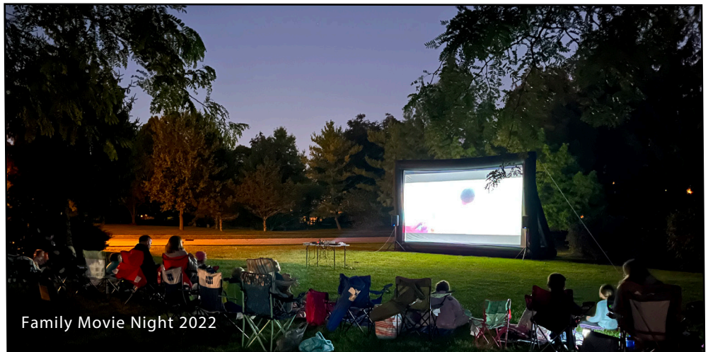
Family Movie Night 2022