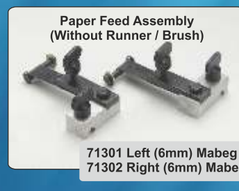
Paper Feed Assembly (Without Runner / Brush)