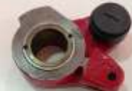
Impression Off Bracket - Komori Sprint

Paper Feed Assembly (Without Runner / Brush)