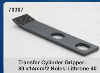
70307 Transfer Cylinder Gripper- 80 x14mm/2 Holes-Lithrone 40