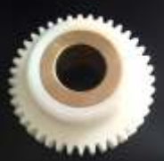
Dampening Roller Gear (Auto plate) with P.B. Bush 38 Teeth Lithrone - 29