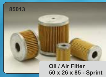
85013 Oil / Air Filter 50 x 26 x 85 - Sprint