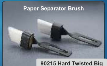
Paper Separator Brush