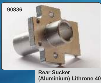
90836 Rear Sucker (Aluminium) Lithrone 40