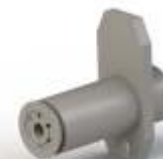
Rear Sucker Lithrone 28