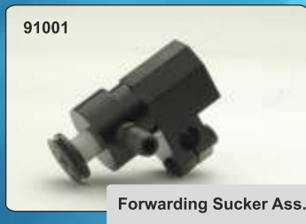
91001 Forwarding Sucker Ass.