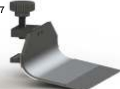
Smoother Strip Bend type Big - Lithrone 28 / 29