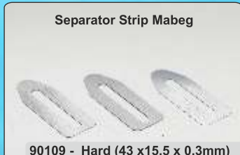
Separator Strip Mabeg