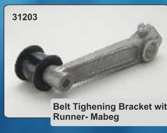
31203 Belt Tighening Bracket with Runner- Mabeg