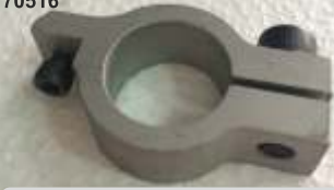
Chain Delivery Gripper Pad Holder- Aluminum- 25MM ID Komori Excel