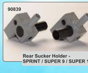
90839 Rear Sucker Holder - SPRINT / SUPER 9 / SUPER 10