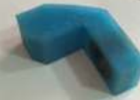
Swing Gripper Pad- Nylon- Lithrone - 28