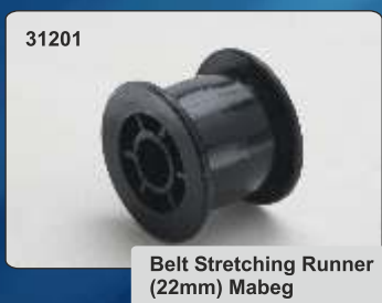
31201 Belt Stretching Runner (22mm) Mabeg