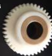
Dampening Roller Gear (Auto plate) with P.B. Bush 36 Teeth Lithrone - 26 / 28