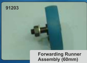
91203 Forwarding Runner Assembly (60mm)