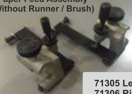
71305 Left 71306 Right Lithrone - 40

Paper Feed Assembly (Without Runner / Brush)