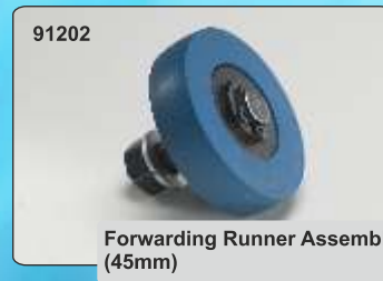
91202 Forwarding Runner Assembly (45mm)