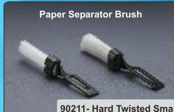
Paper Separator Brush