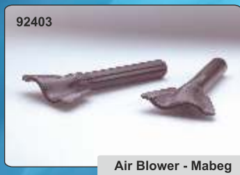
92403 Air Blower - Mabeg