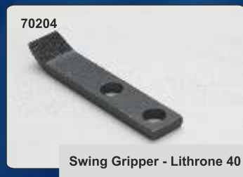
70204 Swing Gripper - Lithrone 40