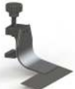
Smoother Strip Right Side Lay- Lithrone 28 / 29