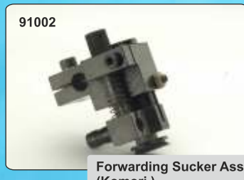
91002 Forwarding Sucker Ass. (Komori)