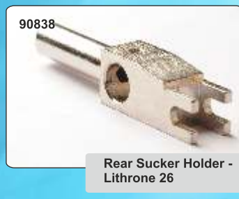
90838 Rear Sucker Holder - Lithrone 26