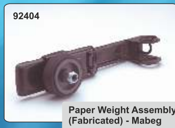
92404 Paper Weight Assembly (Fabricated) - Mabeg