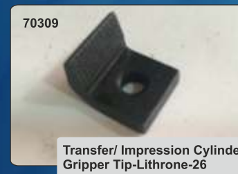
70309 Transfer/ Impression Cylinder Gripper Tip-Lithrone-26