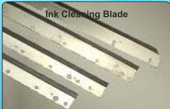
Ink Cleaning Blade