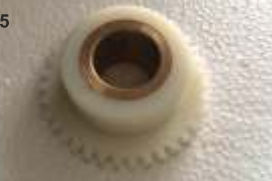
Dampening Roller Gear (Auto plate) with P.B. Bush 40 Teeth Lithrone - 26 / 28