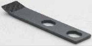
Transfer Cylinder Gripper- 00x00mm/2 Holes- Lithrone 44