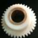
Dampening Roller Gear (Auto plate) with P.B. Bush 36 Teeth Lithrone - 29