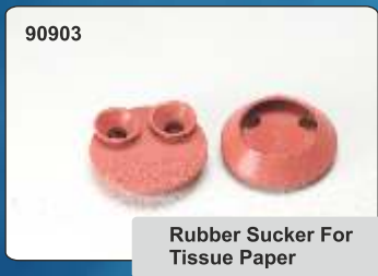
90903 Rubber Sucker For Tissue Paper