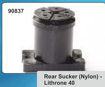
90837 Rear Sucker (Nylon) - Lithrone 40