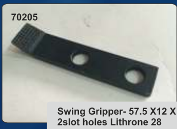
70205 Swing Gripper- 57.5 X12 X 2slot holes Lithrone 28