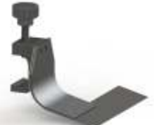
Smoother Strip Left Side Lay - Lithrone 28 / 29