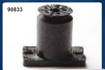
Rear Sucker Holder (Aluminium) - Lithrone 26