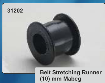
31202 Belt Stretching Runner (10) mm Mabeg