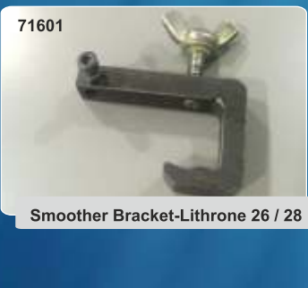
71601 Smoother Bracket-Lithrone 26 / 28