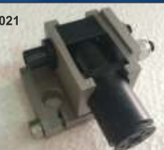
Forwarding Sucker Assembly Lithrone Spica