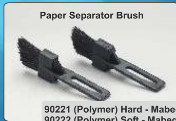
Paper Separator Brush