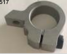
Chain Delivery Gripper Pad Holder- Aluminum- Lithrone 26