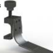
Smoother Strip Bend type Small - Lithrone 28 / 29