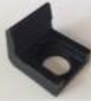
Transfer/ Impression Cylinder Gripper Tip-Lithrone - 40