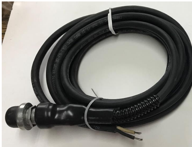
Pickup Side Push Button Wire