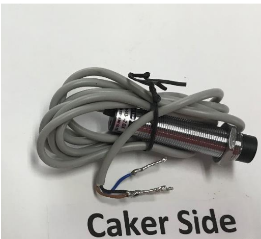
Caker Side Digital Sensor Wire