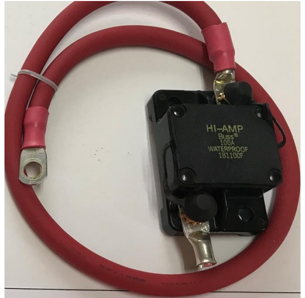
Breaker with Wire