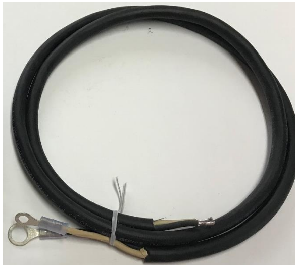
Caker Side Push Button Wire