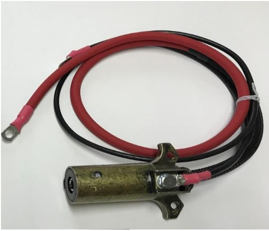
Caker Side Hot Wire with Ground wire Attached