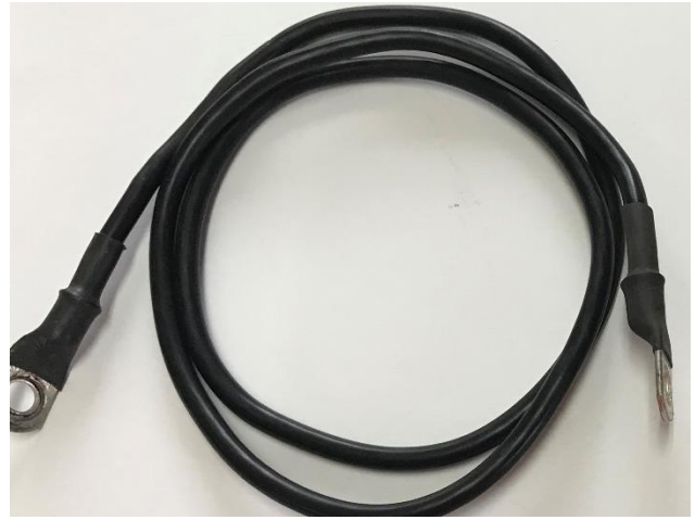
Caker Side Ground Wire