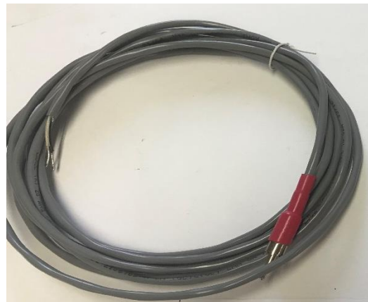
Pickup Side Calculator Sensor Wire