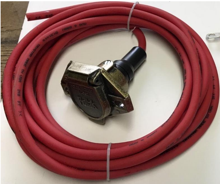
Pickup Side Hot Wire