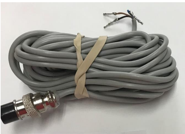
Pickup Side Digital Sensor Wire