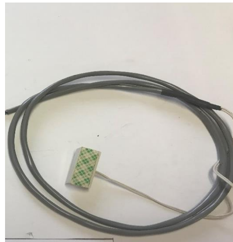
Caker Side Calculator Sensor Wire