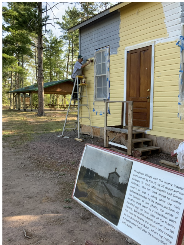
Volunteers help paint the outside of the Depot.

After two years and hundreds of hours of volunteer work and some contract work, the Houghton Depot restoration project is nearing completion. The next few months will see the construction of a platform and ramp. When installed, a wheelchair accessible walkway to the ramp will be built. As a final addition, a twenty-foot section of rail will be placed in front to match the original photo. If you want to learn more about the process of restoration you can see photos in the glass display case behind the kiosk at the Bayview Town Park where the Houghton Depot is located. You can also go to http://www.washburnheritage.org or follow our daily progress at www.facebook.com/Bayviewhistory .