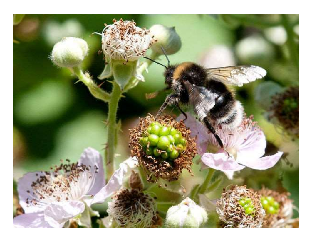
Unraveling the Pollinating Secrets of a Bee's Buzz (11 July 2013, The New York Times)

Below, Will Peterman's photo, Seattle Times. To read more, visit: <a href="http://seattletimes.nwsource.com/html/localnews/2021395297_bumblebeesxml.html">http://seattletimes.nwsource.com/html/localnews/2021395297_bumblebeesxml.html</a>