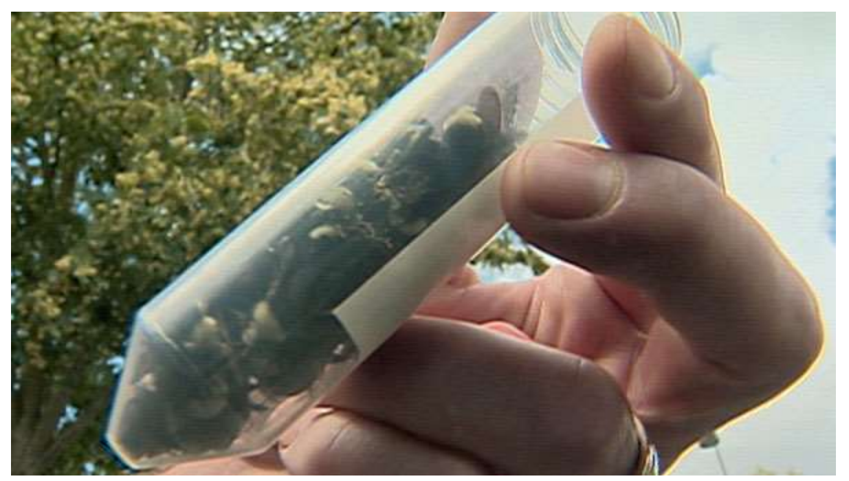
Above, Wilsonville dead bumblebees collected for ODA analysis

Who will speak for the dead bumblebees beneath the lindens? How many more times will this occur before we decide to speak out?