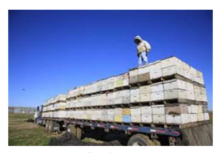
Follow The Nectar!

Issues in Migration: These benefits come at a cost, Gottfried noted. Hiring trucks – see the photo below to get an idea of the size of truck needed – means lots of expense, along with the stress of transport. Worries about the safety of the bees – will they die? – means stress to the beekeeper! You net the bees so as not to lose them in travel while still giving them access to air, but if you stop, the scouts will start going and you will lose bees. This means that the beekeeper tries to go nonstop. Also, bees get exposed to disease & pests. Then, maintaining two locations for your bees means additional expenses. You need some extraction capacity at your winter location, and you need to be sure your summer facility is cared for during winter. Of course, there is wear and tear on equipment and woodenware.