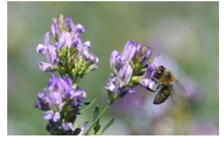
Above left, a bee on buckwheat; right, a bee on alfalfa.

Long distance migration: Gottfried defined long distance as travelling a thousand miles or mor; a medium size operation would have 500 to 1200 colonies that were transported by two 2.5 ton trucks, plus one flatbed 1 ton pickup. Usually there would be two full time and two to four seasonal workers. Gottfried did this for five summers during the mid to late 1960s: his older brother was 25 years old, and Gottfried was 15. They would drive the trucks - loaded with 120 double hives per truck - 1900 miles, from the Canadian to the Mexican border, along U.S. Highway 281. This took 29 hours if they made their best time – more like 32 hours if anything happened. They ended up in Macalomb, Texas, which Gottfried said was the third warmest city in the U.S.: "the last 200 miles felt like being wrapped in warm towel," but it was a great growing area for bee forage.