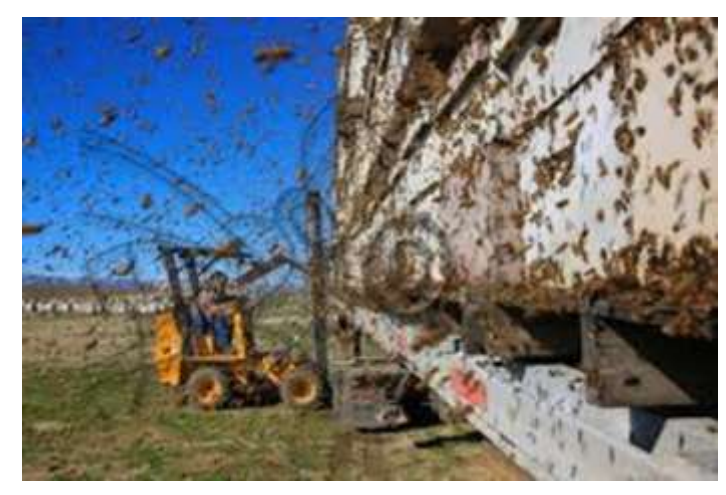
Above left, the palettes for loading bees; right, the Bobcat loading them for the long haul

.... the almond pollination. Their average fee was $175/hour! 1,600 beekeepers came from all over the country, bringing bees. However, the honey production in the almonds is not so good, as the bees are regularly moved short distances for almond pollination: see photo on left, below.