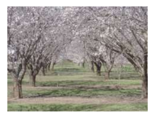
The almond crop of Central California

The citrus crop is based mainly in Fresno, Tulare, and Modesto, where the bees spend mid-March to mid-April. The citrus honey is highly sought after.