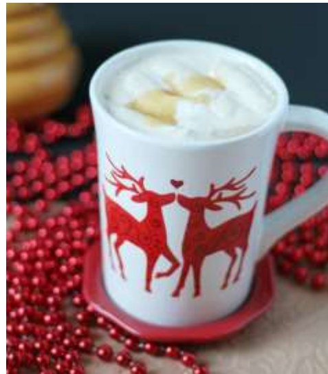
Above left: Coconut Cream Honey Egnog; right, Caramel Caramel Coffee