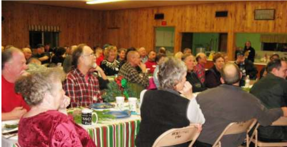
Above: LCBA members at our 5 th annual holiday potluck.