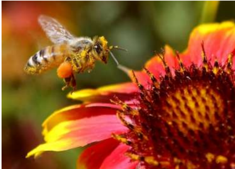
Above, honeybee with bulging pollen sacs and coated with yellow pollen dust visits Gaillardia flowers blooming in a Franklin County flower garden in Pasco, WA

three individual beekeepers are taking the EPA to court for approving Sulfoxaflor, one of a new sub-classification of neonicotinoids acknowledged by the EPA as “highly toxic.” They charge that EPA “violated the Federal Insecticide, Fungicide, and Rodenticide Act (FIFRA) (which “requires the EPA to “determine that a pesticide does not pose an unreasonable risk to the environment or to economic interests”) by granting the pesticide full registration for most crops, dismissing the input from their risk assessors that the field tests supplied by the manufacturer Dow Chemical were insufficient to adequately determine pollinator safety.” Among other concerns, the groups have targeted EPA’s labeling requirements for providing inadequate protection to bees and not taking into account the cost/benefit risks to both the beekeeping industry and the crops it pollinates.