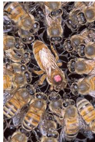
Above left, Africanized queen bee ; at right, European queen surrounded by Africanized workers