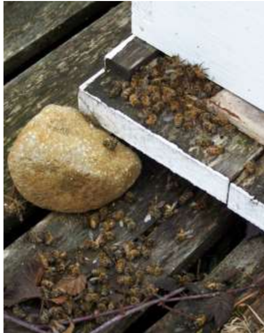
Above, dead bees blocking a hive entrance (photo, Tomme Trikosko).

Good luck - and don't be shy about checking in if you have any questions!