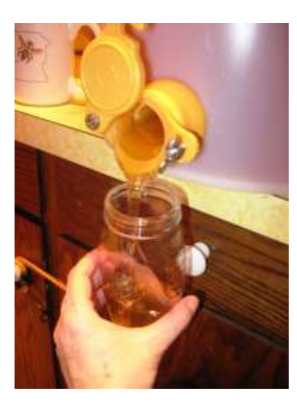
Above left, honey draining from extractor into a food grade bucket. Note the chunks of wax floating on top – getting some of this into your honey is inevitable, given the remnants of cappings on the frames you spin. Middle, about 5 gallons of honey in a bucket with a gate for ease of bottling – look closely, and you can see the layer of wax & foam that has, over several days, risen above the honey. Right, position your bottle, open the gate, & voila – but watch the level (see discussion of "accuracy of filling," below.