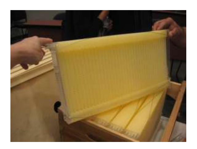
Below, left, a close-up of the frame that slides ajar, allowing honey to "flow" out through a tube; right, Mel inserts the tool that opens the frames.