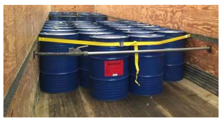
"Illegally Imported Honey" from Department of Homeland Security News Release: on April 28, ICE apprehended 60 tons of honey; on June 29, they nabbed another 60 tons. Both seizures were in Chicago.

Laundering of Chinese Honey in 2001: The Federal Trade Commission imposed stiff import tariffs or taxes to stop Chinese exporters from flooding the market with dirt-cheap, heavily subsidized honey, which was forcing American beekeepers out of business. To avoid dumping tariffs, the Chinese transshipped honey to other countries, switching the color of the shipping drums, documents, and labels to indicate the honey was coming from a tariff-free country of origin like Canada and then shipped to Houston, Texas. It was then sold to U.S. food makers and hotel chains. Some U.S. honey packers began using in-house testing for diluted honey, but some of these sophisticated tests may not have pinpointed the country of origin.