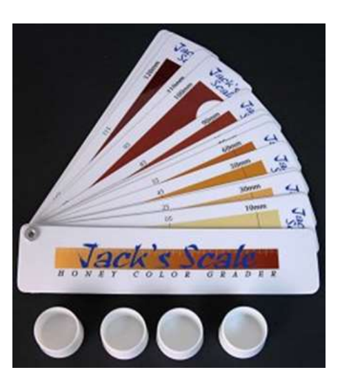
Above, "Jack's Scale," used to categorize honey by color.

Absence of Crystals – Tested Using the Polariscope [Light Box], 10% of Score: Although crystallized honey can be eaten, that is not the ideal! Even honey in its fluid form can contain crystals that may ultimately develop into fully crystallized honey. Crystals are