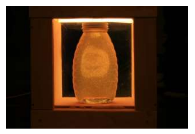
Above, left, honey viewed in a polariscope at the 2015 Fair