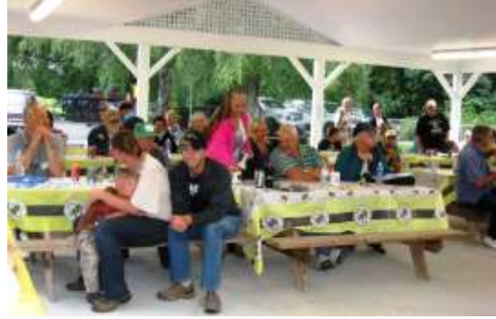
Above right, Lintott Alexander Park in Chehalis ; right, LCBA members at our 2015 Summer Potluck.