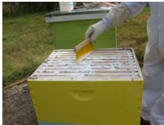
Above, sugar dusting newly hived bees to knock down phoretic mites.

Hiving nucs is a simpler process – just put the frames into the center of a deep and then surround them with empty frames on the sides.