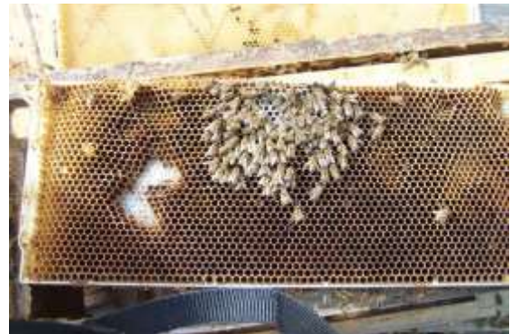
Above left, ", " BeeInformed.org ; right, dead cluster in hive after winter

Though starvation was reported as an issue by some, more often, our beekeepers reported being surprised to find, come late winter/early spring, what had been a large, thriving colony last