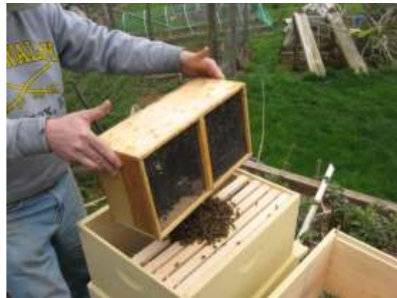
Above left, using a staple gun to affix the queen cage to a frame; right, the “tap & dump” method.

Next: get your package bees into your hive box. There are multiple ways to do this. You can simply take out enough frames to accommodate the package box and set it into the hive box. Another way: you can put the package in an empty box beneath the box with frames: bees like to move up, so they will go up to the queen. (If you are using medium hive boxes, you can lay package on its side.) These methods are referred to as the “kinder, gentler” way to welcome bees to their new home. Less kind & gentle, but quicker, methods: cut the screen out of the package and dump the bees in with “one quick bang,” or can shake them - though that will tear off some feet of bees clinging to the wire mesh. If you use the extra box method to house the package, be sure to remove it and the package when you check that the queen has been released to avoid having bees draw comb in the empty box (or package). Gottfried commented that one good feature of shaking is that the disorients the bees and thus gets them to want to hang onto the frames. Rick noted that he gives a gentle tap and then leaves the box alone.