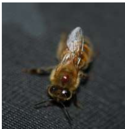
Above, phoretic mites on a honey bee

The study confirmed population trends in both mites and Nosema that beekeepers have observed: “varroa infestations peak[ ] in late summer or early fall and nosema peak[s] in late winter.” Over 50% of beekeepers in the study had “high levels of varroa infestation at the beginning of winter.” This was true even for " well-managed colonies cared for by beekeepers who have taken steps to control the mites," according to co-author Dennis vanEngelsdorp.