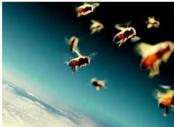
Above, poster for "More Than Honey" ~ LCBA's Nov 13 "movie night" feature

Note special start time for our November meeting! At 6:30 p.m., we'll start rolling the 90-minute new film, "More Than Honey" so we can have time for a break, discussion of the film, and our business meeting. For other upcoming events, please see the newsletter section above.