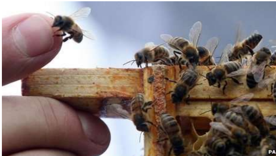
Above, the hardy black bee: photo by BBC News

To read more, visit: http://www.nature.com/nature/journal/v500/n7462/full/500257e.html . Original study published in Molecular Ecology , Vol. 22, pp 4298-4306. Nature reference: Nature 500, 257 (15 August 2013) doi:10.1038/500257e. Published online 14 August 2013.