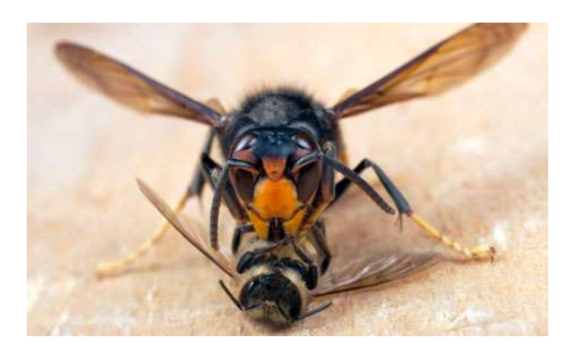
Above, Asian Hornet feeds on honey bee

Further reading: "Bee-killing Asian hornets could be heading to Britain," U.K. Metro, 5 Sep 2013, <a href="http://metro.co.uk/2013/09/05/bee-killing-asian-hornets-could-be-heading-to-britain-3951268/">http://metro.co.uk/2013/09/05/bee-killing-asian-hornets-could-be-heading-to-britain-3951268/</a>. For DEFRA's risk assessment report, visit the 2011 article "Danger! The bee-killing Asian hornet is set to invade Britain," The Guardian, 17 Oct 2011 and click on the link midway through: <a href="http://www.theguardian.com/environment/2011/oct/17/asian-hornet-bee-killer-invasion">http://www.theguardian.com/environment/2011/oct/17/asian-hornet-bee-killer-invasion</a>. For further details, including links to PDFs that compare/contrast Asian with other hornets, read "Asian Hornet alert," 23 Aug 2013, VITA Blog, at: <a href="http://www.vita-europe.com/blog/asian-hornet-alert/">http://www.vita-europe.com/blog/asian-hornet-alert/</a>.