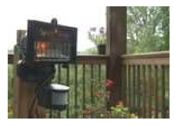
Beekeepers - Got Bears? Here's a Possible Solution....."Spark Away Is The Way – To Keep The Bears Away" - Bee Culture's Catch the Buzz, August 16, 2017: News story: <a href="http://wlos.com/news/local/jackson-county-invents-device-to-keep-the-critters-at-bay">http://wlos.com/news/local/jackson-county-invents-device-to-keep-the-critters-at-bay</a>; Spark Away Home page / order page: <a href="http://www.spark-away.com/">http://www.spark-away.com/</a>

"Olivarez Honey Bees Breeds 180,000 European, Carniolan, And Saskatraz Queens Every Year, And 100,000 More At Their Hawaii Operation" - Bee Culture's Catch the Buzz, August 24 2017: <a href="http://www.beeculture.com/catch-buzz-ohbs-breeds-180000-european-carniolan-saskatraz-queens-every-year-100000-hawaii-operation/?utm_source=Catch+The+Buzz&utm_campaign=c6dbaa401a-Catch_The_Buzz_4_29_2015&utm_medium=email&utm_term=0_0272f190ab-c6dbaa401a-256261065</a>