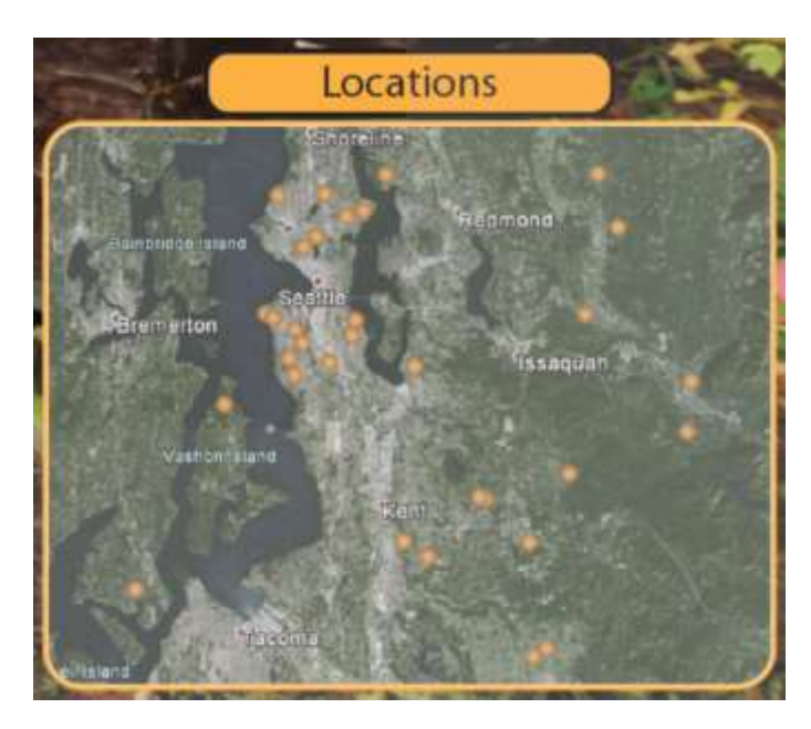
Where Danny's team sampled colonies.

Bee population: Counting bees is difficult and you don't want to disrupt colonies more than you have to, so they came up with a crude sampling method to estimate bee population by looking down into the hive. They called a full frame one where they saw space filled with bees between 2 frames; if no bees in the space, then a zero; and a halfway measure in-between. There was no obvious effect of population size for colonies that lived or died.