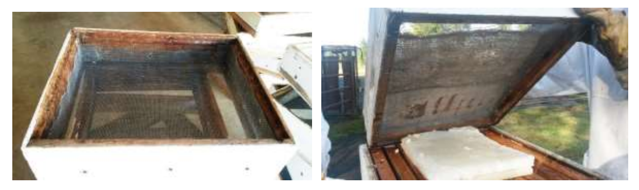
Moisture control boxes, winter feed options, Varroa treatments & more will be covered at our September 14 monthly meeting and September 16 fall management workshop.

Social Time 6 – 6:30 p.m.; Talk & Q&A, 6:30 to 7:30; Break & Business Meeting, 7:30 to 8:45 Centralia College, Washington Hall 103, 701 W. Walnut, Centralia WA 98531