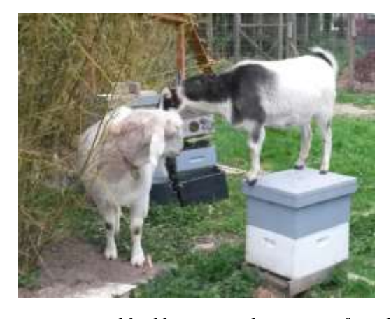
Above, goats grazing on blackberries with an assist from bee boxes.

The devices are somewhat weatherproof, with one sensor outside each colony and one inside. They also invested in 5 more expensive British Arnia sensors that measured weight, temperature, humidity, and more, with 3 data points every hour stored in the Cloud. However, not all 100 hives made it through the winter. On one site, goats were introduced to keep the blackberries down: the goats ate the sensors, along with other things.