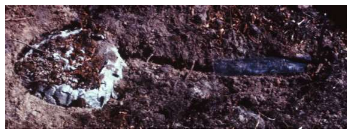
Above: just say no to pouring gasoline into openings to ground nests....

Eradication Do's and Don't's: Carl argued against using gasoline to eradicate a hive whose opening can be seen (see below). The gasoline chemically plugs that tunnel, and the yellowjackets will just dig a new tunnel – but with a very hostile attitude. The Extension brochure suggests non-chemical interventions, which are the best way to deal with them when they arrive uninvited at your barbeque. Carl thinks that the western yellowjacket, not the bald faced hornet, has the shortest fuse: "they'll crawl into your pants legs, and - it's bad." The nest above, displaying a very tight scallop pattern, is also unusual because usually the common yellowjacket is a cavity dweller: however, this colony, living under a deck, didn't read the textbooks.