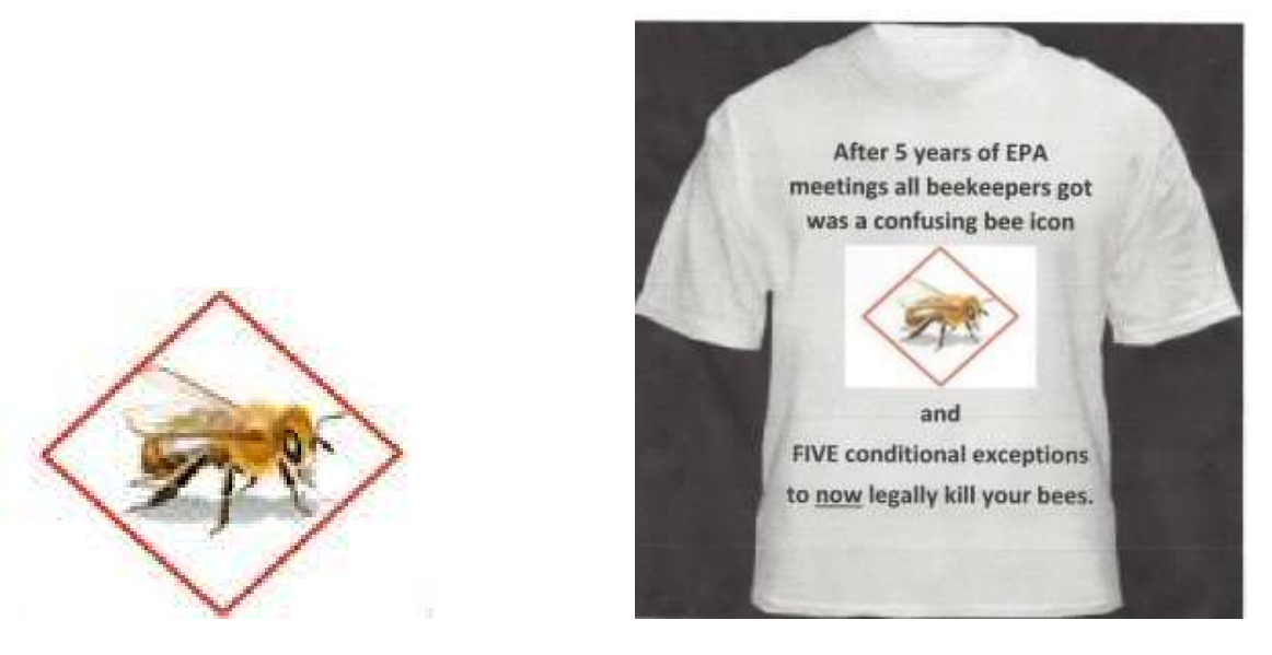
Above left, EPA's new neonicotinoid warning label's bee image; at right, Pollinator Stewardship Council's visual commentary

The EPA has unveiled its new neonicotinoid label, but ambiguities and exceptions leave many wondering how effectively it will protect bees. The neonics labeled will be imidacloprid, clothianidin, thaimethoxam, dinotefuran, acetamiprid, and thiacloprid. The EPA plans, however, to "harmonize" the label's language "across all chemistries."