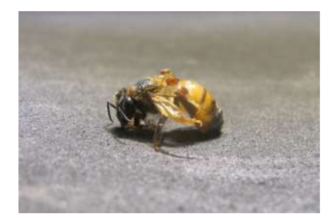
Monsanto is exploring the use of RNA interference to kill a mite that may play a role in bee die-offs.

"Genetic Weapon Against Insects Raises Hope and Fear in Farming" [27 Jan 2014, The New York Times ]