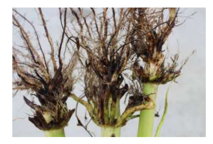
Monsanto is also exploring RNA interference to kill rootworm damaging corn

The Times reports that "Monsanto is also looking at putting RNA into sugar water fed to honeybees to protect them from the varroa mite. . . If the RNAi is directed at a genetic sequence unique to the mite, the bees would not be harmed by ingesting it, while the mites would be killed once they attacked the bees. One field trial showed that this technique could help protect bees from a virus. Monsanto acquired Beeologics, a company developing the RNAi technology for bees." To read more, visit: <u>http://www.nytimes.com/2014/01/28/business/energy-</u>environment/genetic-weapon-against-insects-raises-hope-and-fear-in-farming.html?emc=eta1.