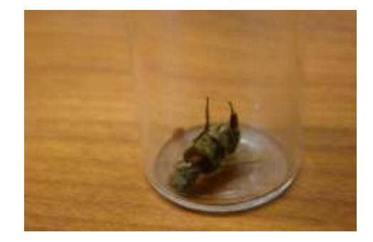
Above left, zombie fly analyzed in OSU laboratory; at right, honey bee killed by zombie fly parasitism. Note the brown, rice-grain-like pupae of the zombie flies; these flies inject their eggs into bees' abdomens.