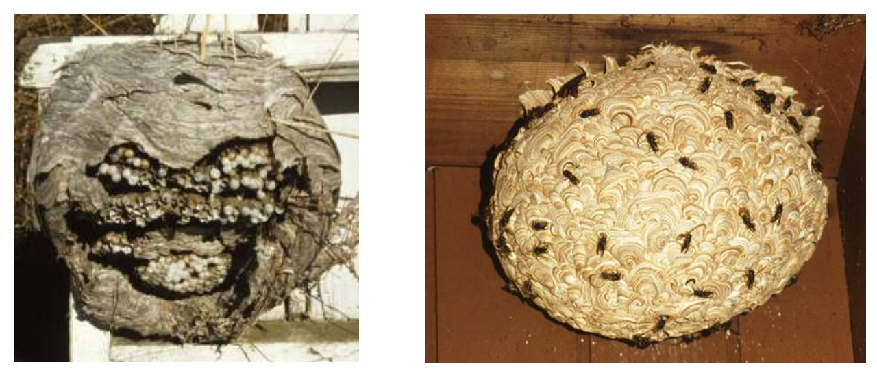
Above left, cross-section of yellowjacket brood from an exposed nest built into a chair; at right, classic common yellowjacket nest shows characteristic, tightly scalloped pattern.

Carl showed a remarkable series of photos of typical nests. Vespula pensylvanica, the western yellowjacket (above, right), is the type that tries to eat from your plate during a picnic. Note the scalloping that is the definitive feature of these nests.