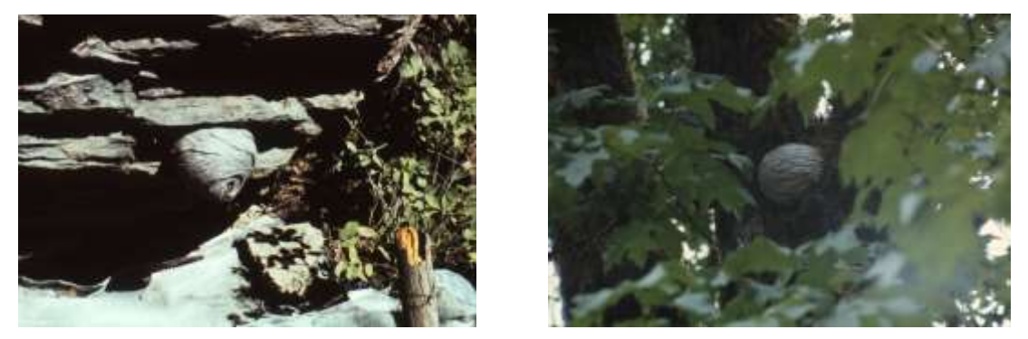
Above left, a yellowjacket nest "in nature"; at right, a rare Dolichovespula norvegicoides nest.

In "nature," we may find yellowjacket nests not in the ground, but in aerial nests built under structures like eaves or pump houses. They clean out dead larvae, insect parts, etc. Among aspects of their behavior still unknown are what proportion of larvae die and get carried away. To excavate old nests, they simply collect them: no complex equipment is required.