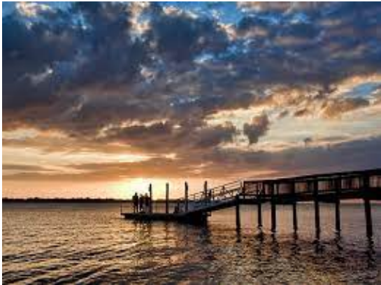
Fishing Pier at Emerson Point Preserve

The BOCC is expected to put the Emerson Point Expansion purchase on its March 12 agenda. You can contact individual BOCC members by calling 941-745-3700 or visiting the county website for email addresses here .