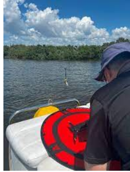
Suncoast Waterkeeper teams monitoring mangroves.