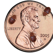
The size of an adult bedbug compared with a US penny

Bed bugs are nocturnal parasitic insects that feed on blood, thus attracting them to humans. Bed bugs bite and cause rashes. They like to hide in warm spaces, including the cracks and crevices of mattresses, furniture, and bedding.