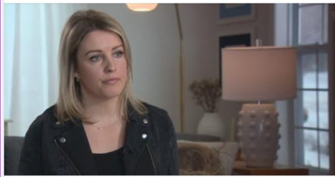
CBC/CA Saint John support group offers a haven for survivors of infant and pregnancy loss | CBC News