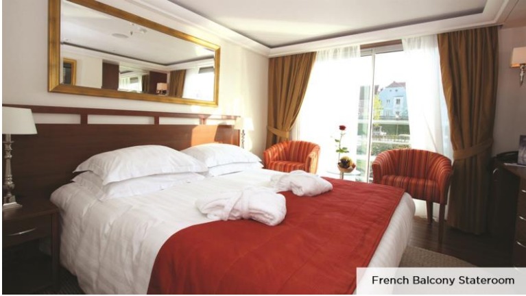
French Balcony Stateroom

7-night cruise | March 13-20, 2025 | Aboard AmaLyra