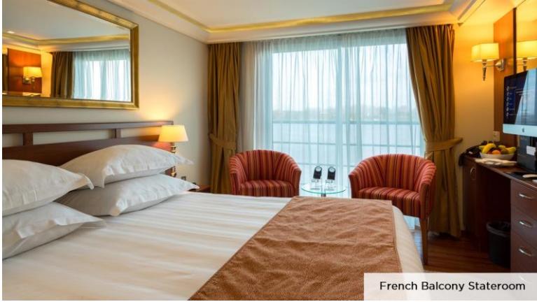
French Balcony Stateroom

7-night cruise | June 13-20, 2024 | Aboard AmaDolce