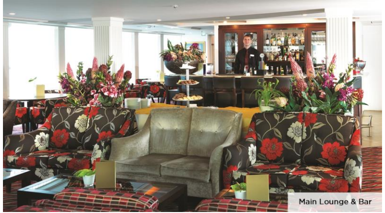
Main Lounge & Bar