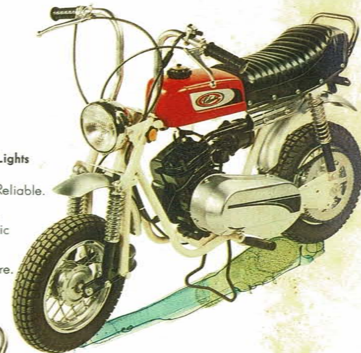
MINI-CYCLE Model Nos. 703-2 [5 H.P.] 753-2 [5 H.P.] Alternator & Lights

A real trail blazin' buddy! Rugged. Ready. Reliable. Handles rough terrain with unquestioned authority. Exclusive leading link suspension cushions shocks more evenly while assymetric torque converter puts power where you need it . . . when you need it. Against others in its class, there's nothing to compare.