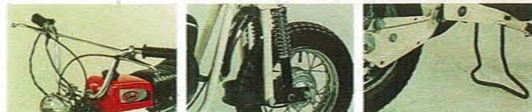
Motocross Handlebar (703-2 and 753-2) Extra strength and durability with chrome motocross handlebar. Adjustable and removable.