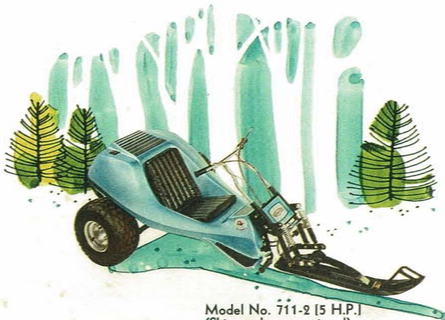
Model No. 711-2 [5 H.P.] (Ski attachment optional)

Speeding or cruising, you'll thrill to a whole new dimension of fun to be found. Here is a rugged, rock steady, ground hugger built to perform equally well in trails, on sand, through snow or just about anywhere you want to go. Flat out, it's real honest-to-goodness excitement that invites you to jump on and take off.