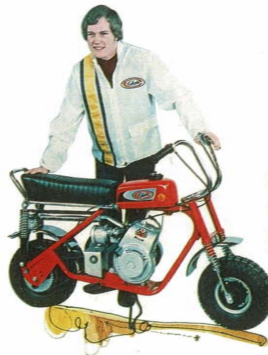
Model No. 523-2 [4 H.P.] Complete with Torque Converter

Real going bikes — Columbia! Start up these upstarts and you'll see for yourself. Here is an exciting combination of power, performance and versatility. Trail huggers all the way. Columbia is really what bikes are all about!