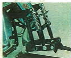
Double spring front shocks help cushion the bumps, whether with wheel or optional ski.