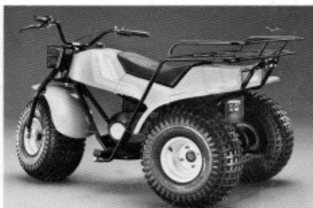
Shown with optional carry rack and light kit.

*8 & 10 H.P. engine, industrial/commercial-rated with cast-iron sleeve, ball bearing crank and 4-amp, 12-V alternator. Model 310 includes 12-V battery.