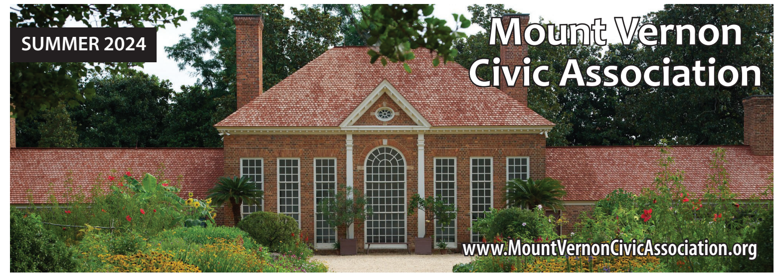
Belle Rive • Ferry Landing Estates • Ferry Landing Villa • Ferry Point Estates • Mount Vernon Forest Mount Vernon Grove • Mount Vernon Park • Oxford • Riverbend • Riverwood • Vernon Square • Washington Woods Westgate • Wycliffe on the Potomac • Yacht Haven Estates