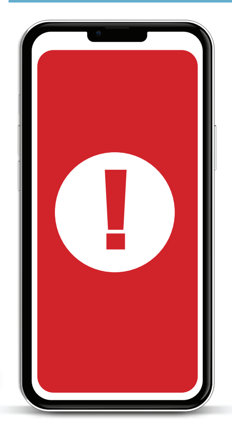
*Smishing = social media phishing

The FBI released news about a "smishing*" scam taking place across the US, and for those who drive on toll roads around our area. Scammers are texting individuals and requesting money for unpaid tolls.