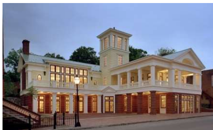
International Storytelling Center

September 13-18 , the Friendship Force Club of Eastern Washington/Northern Idaho (otherwise known as Spokane) is visiting Knoxville. I had such a great trip there last fall with the Western NC club, and I want to show the beauties of East Tennessee. The committee has established a wonderful itinerary that shows off the many facets of Knoxville and East Tennessee.