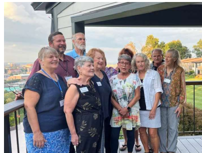
Eastern WA/Northern ID Ambassadors