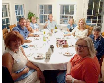
Small Group Dinners