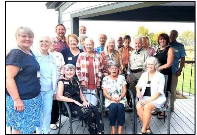
Ambassadors & Hosts