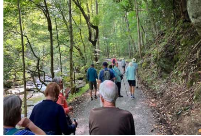
Great Smoky Mountain Natl Park Day