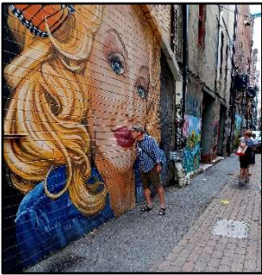
Urban Walk – we always see Dolly!