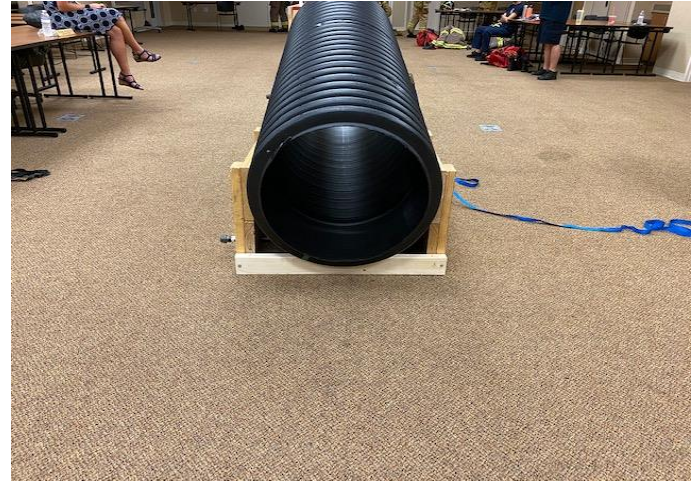
Plastic Tube Entrance 3" off floor