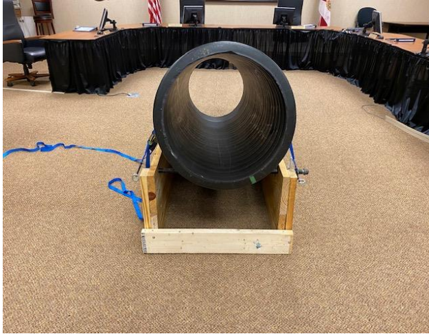
Plastic Tube Exit 18" off floor