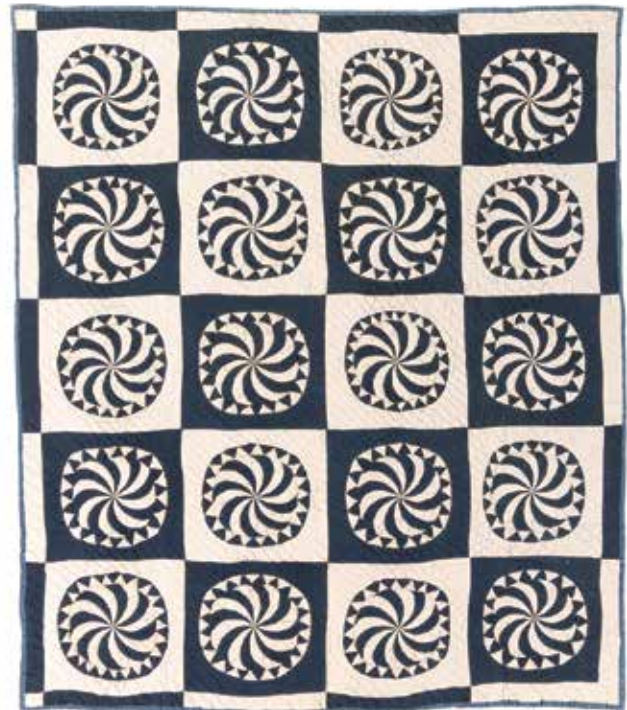
Image: Wheel Pinwheel, maker unknown, made in the United States circa 1890-1910. Collection of Ken Burns.

Resources used for this article include the following. All resources include additional pictures of Ken Burns quilts.