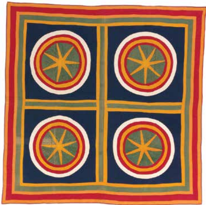
Image: Sand Dollars Sand Dollars, maker unknown, made in the United States, circa 1880-1900 Collection of Ken Burns.

Uncovered: The Ken Burns Collection opened at The International Quilt Study Center and Museum ( www.quiltstudy.org ) at the University of Nebraska-Lincoln in mid-January. It runs through May 13. This spring, Nebraska Educational Telecommunications (NET) will complete production of a show on the exhibit. The show will be available on their website.