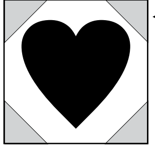
▼ PRESS CORNER SQUARES BACK. TRIM EXCESS SEAM ALLOWANCE FROM BACK OF BLOCK.

Trim excess fabric layers from back. Square your block to 12.5" unfinished.