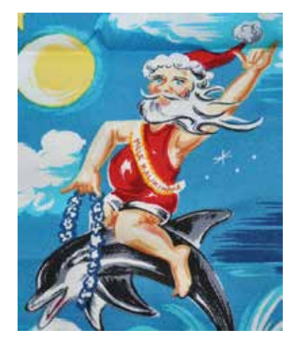
*actual ugly fabric

Looking ahead - our April exchange will be Civil War fabrics. Sign up at the March meeting.