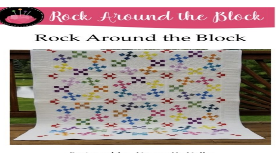
Designed by Nancy McNally No "Y" seams, easy piecing Quilt size: 44" x 56" Block size: 11 ¼" finished