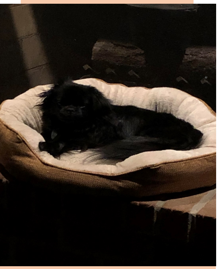
Wow ladies! You put on quite a show. So many beautiful quilts. This has really made me tired watching all that was done to make this show happen. Congratulations for a job well done. I can't wait for the next show!