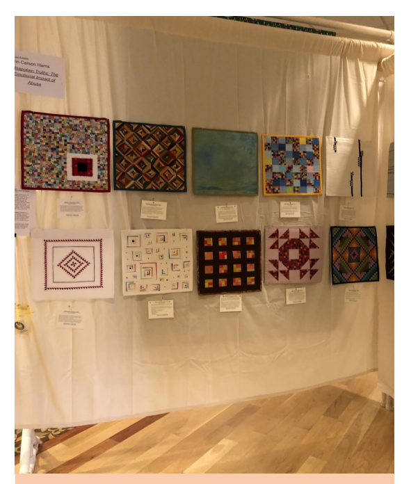
Special Exhibit: Lynn Carson Harris Domestic Abuse Series