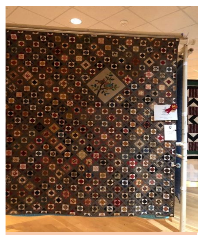
Viewers Choice: 2nd Place