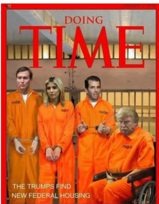
The "links" that bind our family together!

What are your thoughts? Write me letter, or even send a short Email or text and give us your analysis on where you think it all goes, or where you'd like to see it head and end up. I'd LOVE to see 10 or 20 of you respond and we can put some of them in the next newsletter.