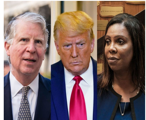
Trump flanked by D.A. Cyrus Vance and NY Attorney General, Letitia James