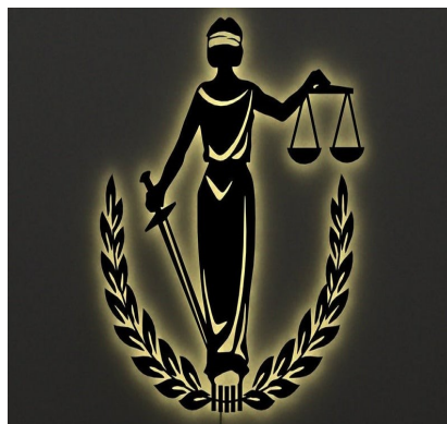
LADY JUSTICE A most patient woman