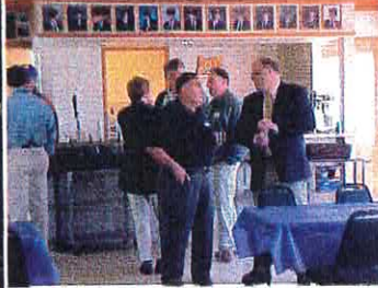
More Happy Hour