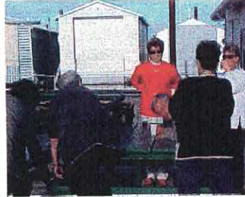
Happy Hour Outside—A Beautiful Day