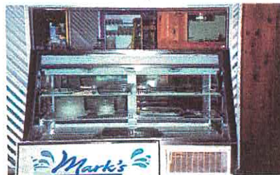
The Deli and Dessert Case

We are fortunate to finally have a floating restaurant on the river in this area, which hasn't happened since the River Queen was scuttled. See you'all at MARK's!!!