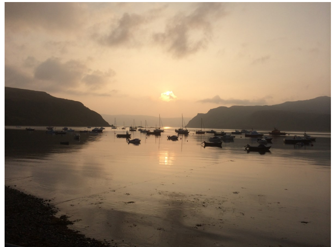
Portree Harbor on Skye at dawn (bottom)

that many people who live there don’t consider themselves Scots. They are Orcadians, many of whom maintain emotional ties to Norway. We had a great tour guide who passed on stories of their history and the present day. The Orkneys have several fine examples of standing stones and a prehistoric village.