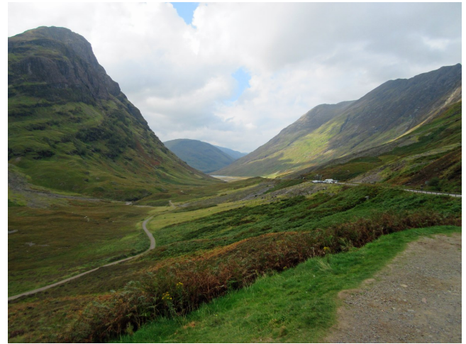
The area near Glencoe (top)

We loved the scenery, especially on Skye, the Glencoe area, and the “Road to the Isles” from Fort William to Mallaig on the mainland across from Skye. As we traveled around, the terrain changed quite a bit, especially from the west coast to the east coast. We had a great tour out of John O’Groats to the Orkney Islands. We found it interesting