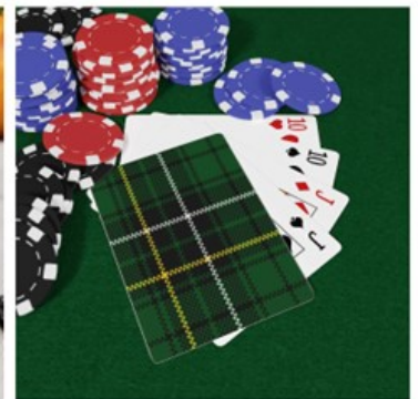
MacAlpine Tartan Poker Cards