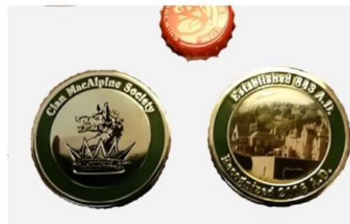
Boar's Head Challenge Coin