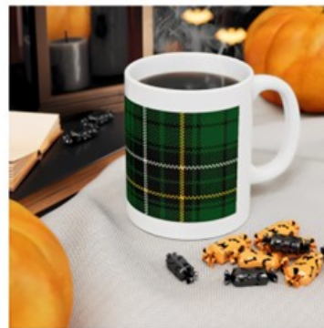
Tartan Mug 11oz