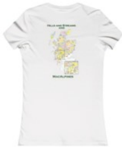
Hills and Streams and MacAlpines Women's Tee