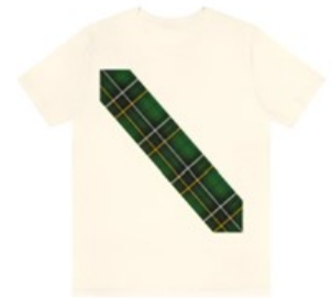
MacAlpine Plaid Sash Short Sleeve Tee