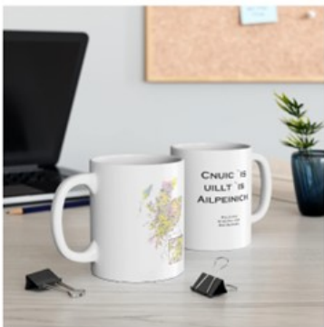
Hills and Streams and MacAlpines Mug 11oz