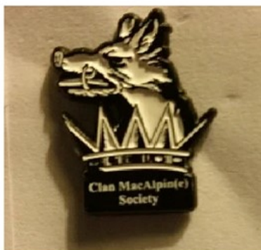
Boar's Head Lapel Pin