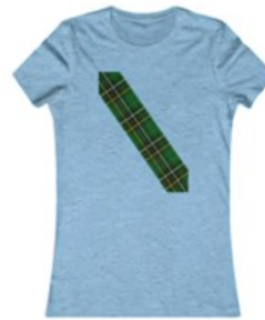
MacAlpine Plaid Sash Women's Tee