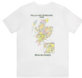
Hills and Streams and MacAlpines Unisex Tee