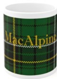
Tartan with MacAlpine Mug 11oz