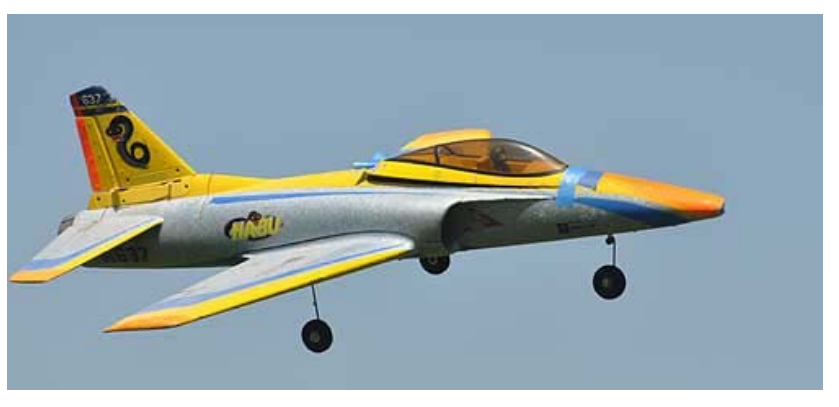
Stanley Dill's HuBu