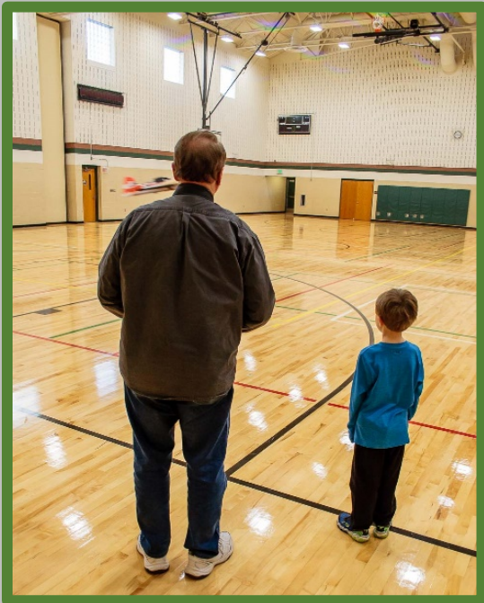
Flying in the gym