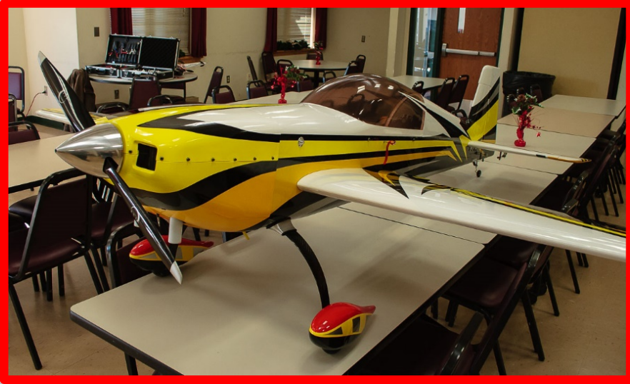
One of Gary's planes on display