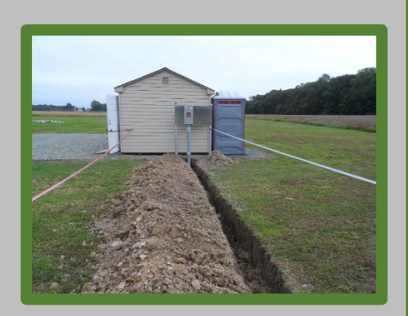
Electric installation Progress Saturday, 10/6/18