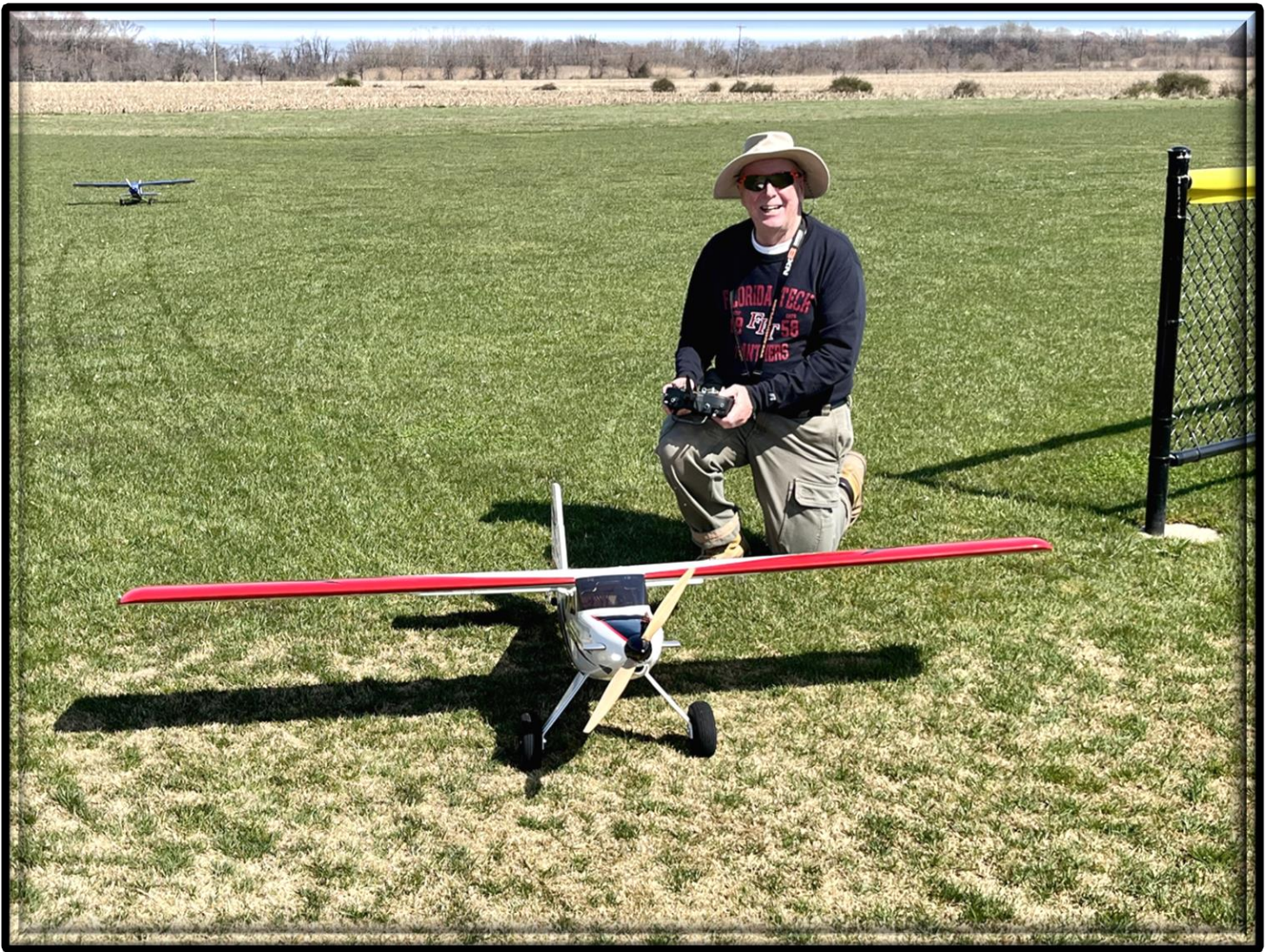
Bob's Fleet on the Runway