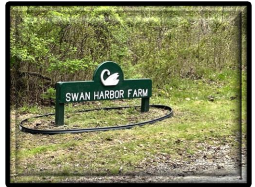
New Main Entrance Sign