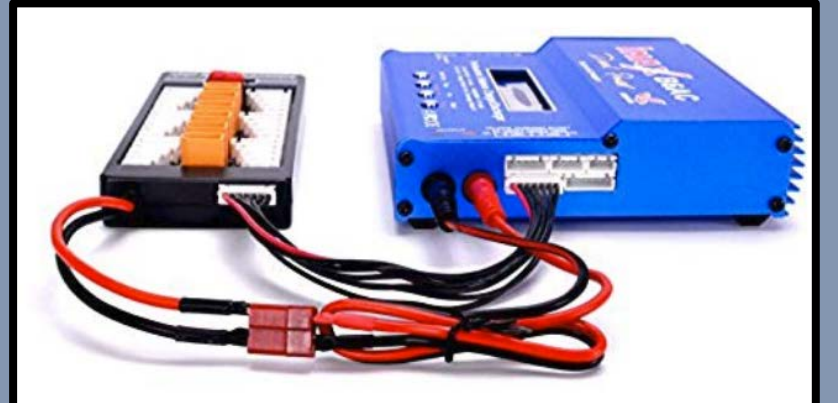
Example: Single Port battery charger with a 6 Port XT-60 Parallel Balance Port Charging board connected. Batteries will connect to the Parallel Charging Board.