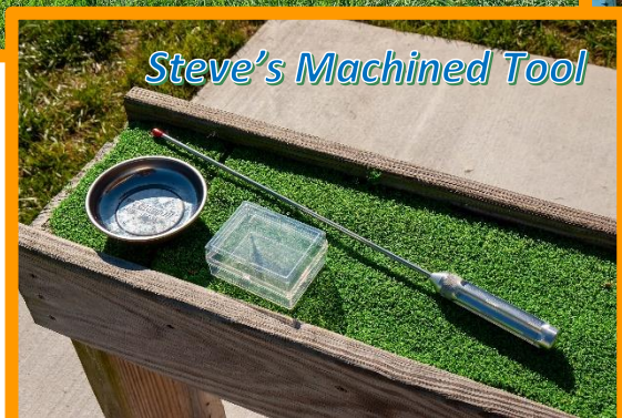
Steve's Machined Tool