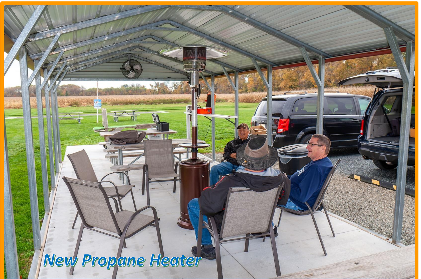
New Propane Heater