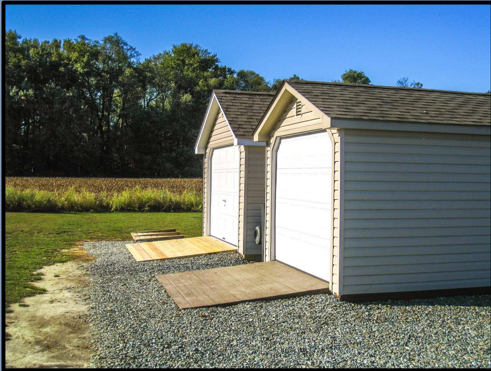
Our new shed with newly installed ramps to match the old shed. Scott Jordan installed the ramps at the beginning of October.