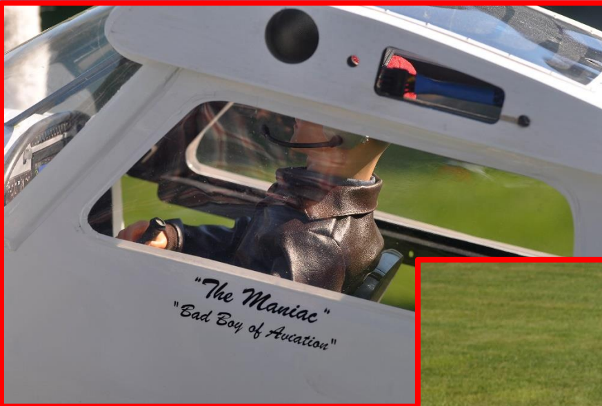
The pilot's head turns left & right with a transmitter switch