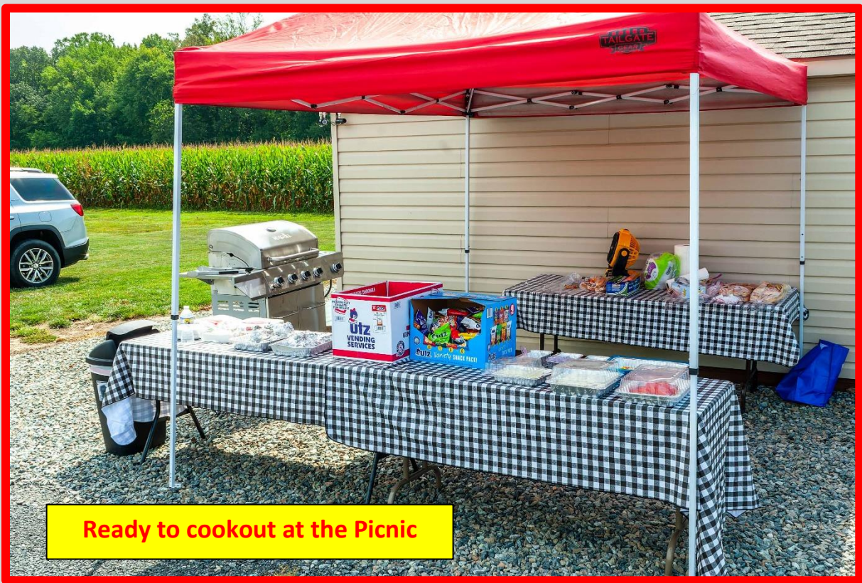
Ready to cookout at the Picnic