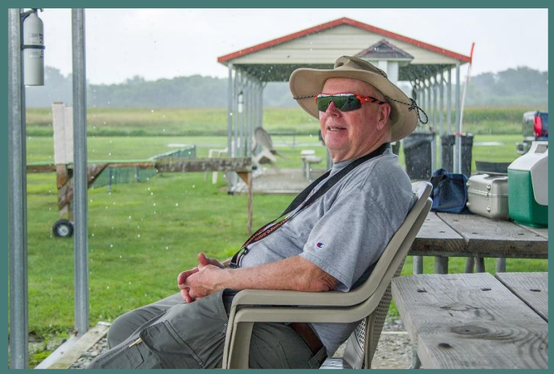
Checking out the weather radar