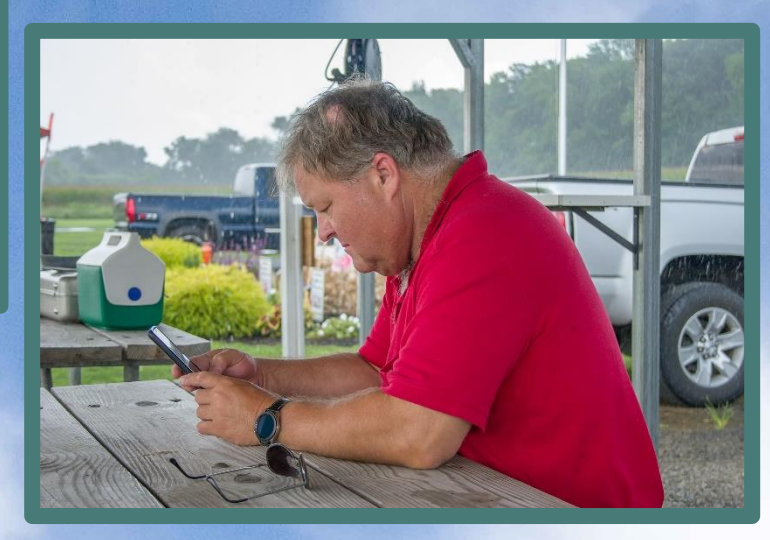
Waiting for the rain to stop