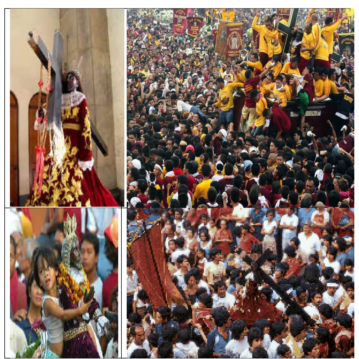
Why would Jesus Christ, the Holy Spirit, possess this wooden statue, Black Nazarene? Four million joined the procession last January 1, 2014 which started at 5:00 AM and lasted at 12:00 noon. What can we say people? Just say, "Sus maryosep!"

Hey 82 million Catholics (out of 91.6 million Filipinos) in the Philippines, know what you are doing, know your own evil! Do not blame the government for your demonic acts! You are the ones who chose them to govern you. Corruption and poverty is your reward!