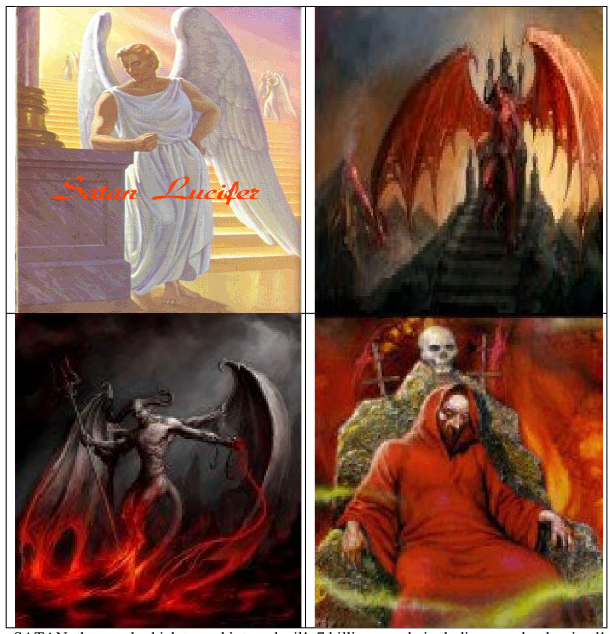
SATAN, the angel which turned into a devil! 7 billion people including you, he deceived!