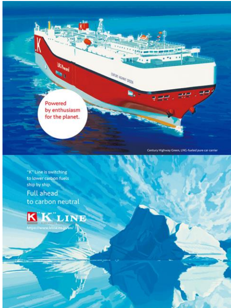
【An LNG-fueled pure car, truck carrier】