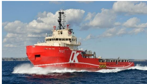
Offshore Support Anchor Handling Vessel "Akatsuki"

POC will outsource to KWS: (1) Reflagging the foreign-flagged offshore installation vessels to be owned by the subsidiary, JOM, to Japanese register, and (2) Subsequent management of vessel operation, maintenance works, and crewing. POC will also utilize offshore support vessels owned by KWS. In addition, both companies will cooperatively investigate the construction and co-ownership of Service Operation Vessel (SOV) and others required for Operation & Maintenance (O&M) works after start of wind farm operation.