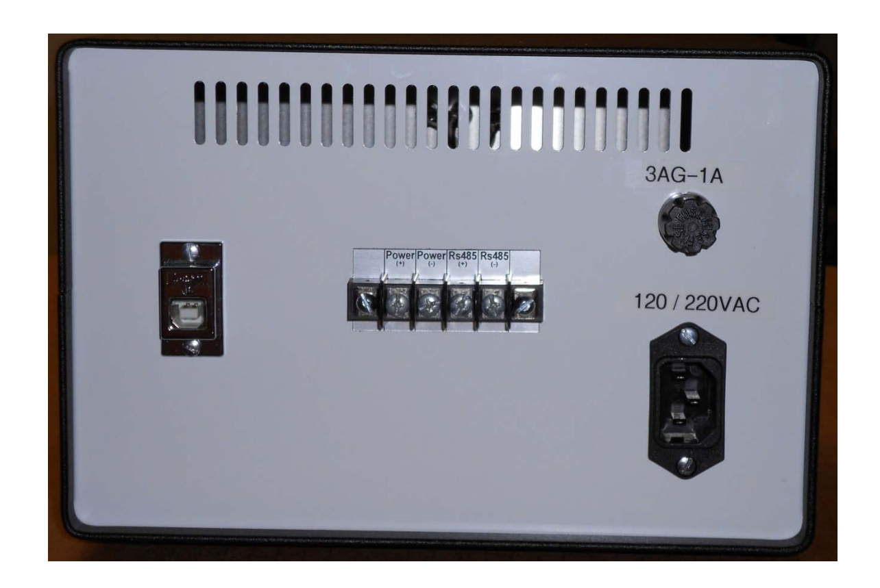
Figure 1 Rear Panel Connections